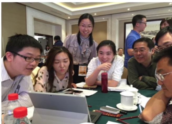
The ability to run “what-if” scenarios and get immediate feedback helps policymakers make better choices

Policymakers can use CarbonSim to see how the choices that they make – about both program design and administration – could affect the performance of the ETS. Industry carbon managers have an opportunity to deploy a variety of strategies – involving production changes, the use of abatements, and trading – to satisfy ETS obligations.