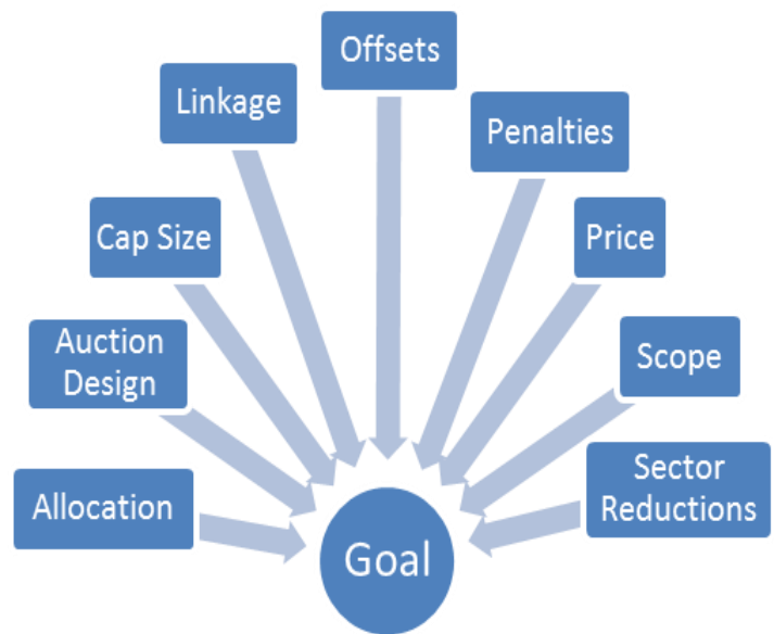
CarbonSim allows policymakers to experiment with different ETS designs to achieve a defined goal

Prior to launching an ETS , policymakers must decide the goals of the ETS and the best means to achieve them. Goals include requisite emission reductions and the date by which they must be realized. Design decisions include cap size, number of companies, required reductions, allowance distribution, registry administration, market oversight, and penalties and enforcement. Market related decisions touch on auctions, reserve, price floors/ceilings, offset restrictions, and spot/forward trading restrictions, auction frequency and design, exchange use, as well as intervals and means of government intervention against market failure.