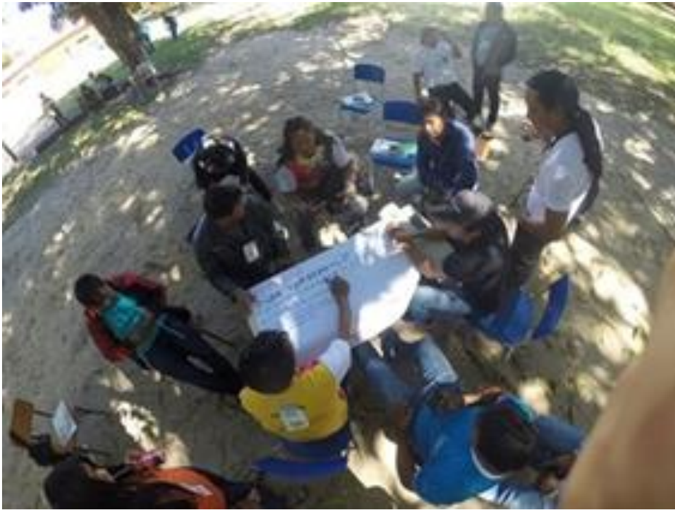
Figure 4: Planning for Indigenous territories subprogram