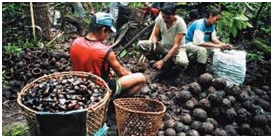
Figure 2: Forest people collecting Brazil nuts

Acre's SISA made an important, but relatively unheralded, innovation. Article 4 specifies who the providers of environmental services under the law are, and Article 5 defines what the environmental service providers must do to become beneficiaries of the SISA 7 . It has often been assumed, particularly in offset project methodologies, that allocation of carbon rights is central to an effective incentive system for reducing deforestation – and that legal determination of who the rights holders are is an indispensable prior step to creating such a system. In the SISA, providing the service of reducing emissions, i.e., taking actions that result in reducing emissions, is the operative principle, not ownership of particular carbon stocks or land areas. Conceptually this is perfectly consistent with emissions reductions crediting systems more broadly. A company that voluntarily chooses to generate an emission reduction credit by reducing its own emissions more than required or that produces renewable energy so as to lower the emissions intensity of the broader power system is not transferring rights to coal or oil stocks. It is earning a carbon credit because it has acted to reduce its own or others' emissions beyond any legal obligation.