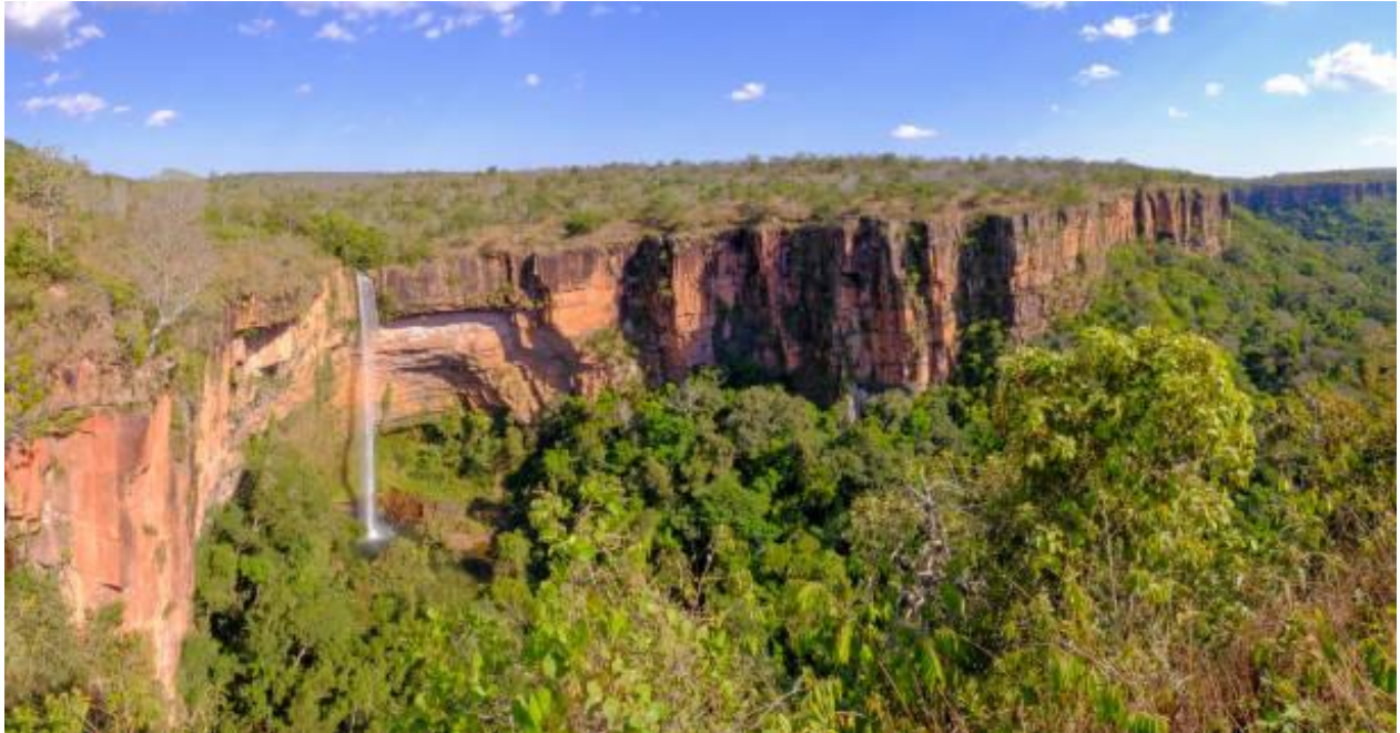
Figure 3: Chapada dos Guimarães, Mato Grosso

In 2017 REM allocated about $54 million to Mato Grosso, from the German Federal Ministry of Economic Cooperation and Development and the British Energy and Industry Strategy, for reductions in deforestation between 2015 – 2019, purchased between 2017 – 2020. The state committed to maintain deforestation below 1,788km 2 /year, and succeeded in doing so over the life of the program. The program directed 40% of the resources to institutional strengthening of the state’s system of incentives for environmental services, and 60% to three on-the-ground subprograms: family agriculture, traditional populations and communities in the Amazon forest, Cerrado (savanna), and Pantanal wetlands regions; Indigenous territories; sustainable agriculture and cattle raising by middle-sized rural producers 8 . About US$7.13 million or 13% of